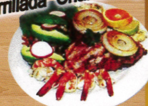
Parrillada Charro Negro